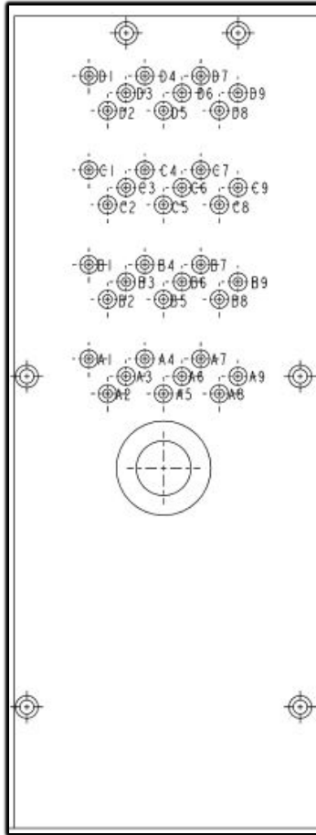
Mini-SAS HD connector pinout