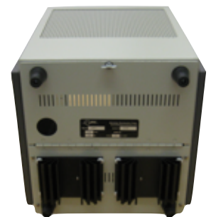
AP-3 Rear Panel Shown Above