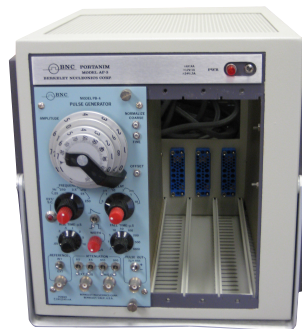
AP-3 with DB-4 NIM Pulse Generator shown above

BNC-blue painted blank panels are available to cover unused module cavities. The part numbers are: Single-width P/N 6823; Double-width P/N 6824; Triple-width P/N 6826. Empty modules in various sizes are available for OEMs or others who wish to design plug-in instruments for Portanims. Contact BNC for source information on modules in bulk or kit form.